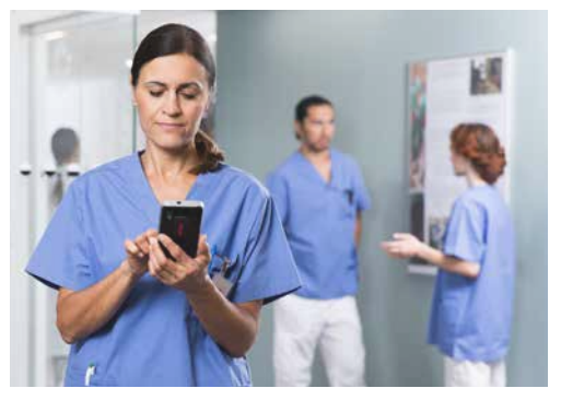
Lets clinicians access and share lab results, images, requests and alerts while on the go.