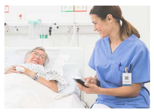
Bedside care: single-entry vitals registration to EMRs/EHRs without leaving the patient.

An Ascom Myco 3 solution makes available a wide spectrum of up-to-date clinical information.