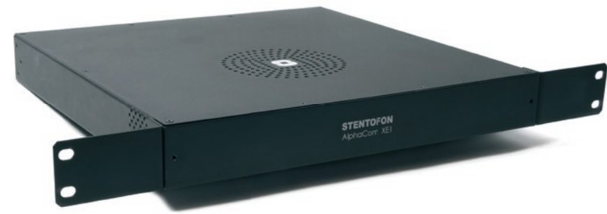
1 UNIT HIGH AUDIO SERVER SUPPORTS 2-552 IP STATIONS