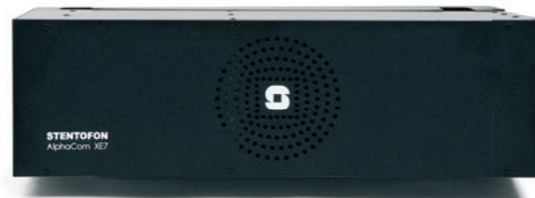
3 UNIT HIGH AUDIO SERVER SUPPORTS 2-552 IP STATIONS AND 36 ANALOG STATIONS