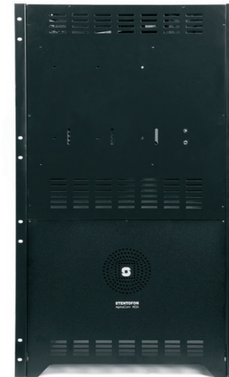
6 UNIT HIGH AUDIO SERVER SUPPORTS 2-552 IP STATIONS AND 102 ANALOG STATIONS